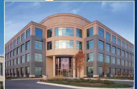
Beltone headquarters at Prairie Glen Corporate Campus, Glenview, Illinois